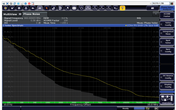
The R&S®FSWP displays the achievable level of sensitivity with grey color-coding.