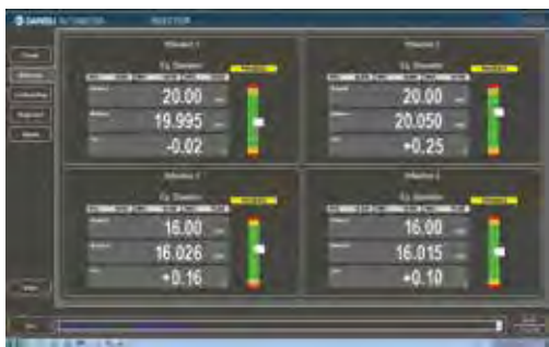
HiSECTION HMI workstation interface