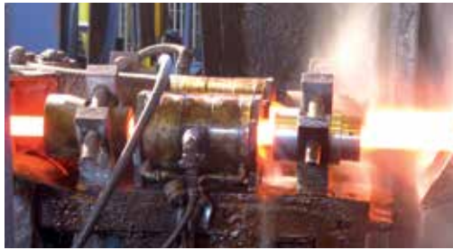
HiSECTION plant installations